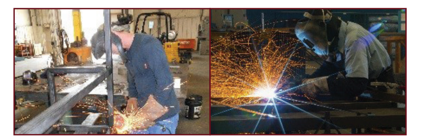
Welding & Fabrication