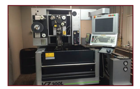
Wire EDM - 12" 18" 9"Z